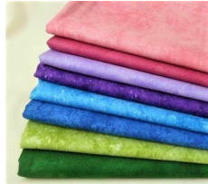
What's New In Fabrics