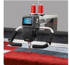
Services & Classes