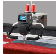
Services & Classes